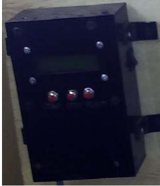
Plate 8: Panel Box

This is a metal box that serves as an encampment or housing to the panel and the microcontroller in the box. It is sized as Length – 11cm at the top, Breadth – 10cm at the bottom and the Height – 6.5cm.