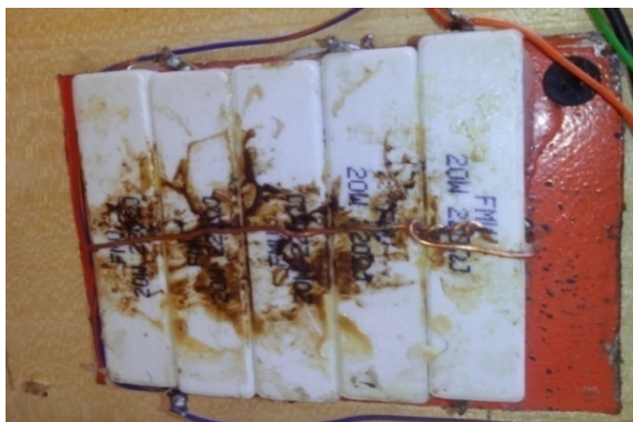
Plate 2: Heater

temperature exceed the required temperature and switch it on when below the expected temperature at a particular moment by the use of the TRIAC, which is the electronic switch that regulates the temperature. The total number of heaters used is 20 pieces which is 5 heaters in 4 places and screwed to the structure (Brooder) but separated by an insulating material to the wood.