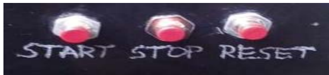
Plate 6: Buttons

The button is a part of the brooder cage which is located at the external part of the brooder, mainly to perform the function of controlling of the brooder. There are three buttons in the structure; START, STOP and RESET. The start button is to put the brooder into work. The stop button is to halt the work of the brooder and the reset button is to clear the readings on the LCD screen and reset the brooder to start working again. The switch on the brooder is to ON/OFF the brooder after being plug to the socket by three gang plug for supplying of current to the brooder and there is also an electronic switch inside the brooder cage on the PICB for regulating the temperature by switching off the circuit automatically to when it is higher than what programmed and switching it on when the temperature is below what is expected.