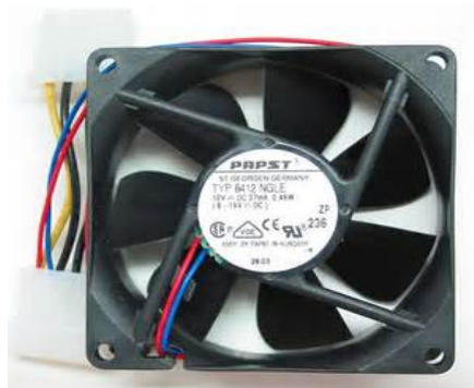
Plate 5: Fan

This is another essential part of the brooder; the fan is 12x12 in dimension. The fan performs two functions, which are; circulation of the heat in the brooder cage to prevent segmentation of heat and also disperses heat by blowing out air through the holes around the structure.