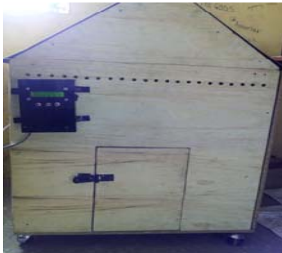
Plate 1: Housing Structure

The brooder is constructed to house the day old chicks. It is developed purposely to enhance poultry production especially during the brooding stage. The essential Parts includes: Housing, Pic, Sensor, LCD, Fan, SHT 11, Heater and White led bulb.