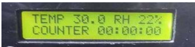
Plate 4: Liquid Crystal Display Screen (LCD)

Liquid crystal display is another part of the brooder with screen size of 7x2.5 (cm) and the dimension of the housing of the screen and panel is 11cm and 10cm for top and bottom length of the housing respectively, and with height 6.5cm in which the panel is also connected to the PICB and does the work of receiving the measured temperature and humidity by the DHT 11 and then display the temperature and humidity.