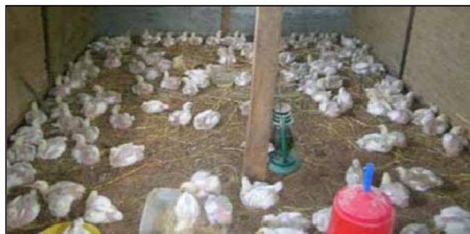
Fig 1: Manual Brooding management

According to Achi (1992) [1], brooding refers to the period immediately after hatching when special care attention must be given to chicks to ensure their health and survival and the process by which heat is supplied to newly hatched chicks, until such time that their thermo-regulatory mechanism is functional.